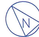
Third Floor Plan East Building Hollins University