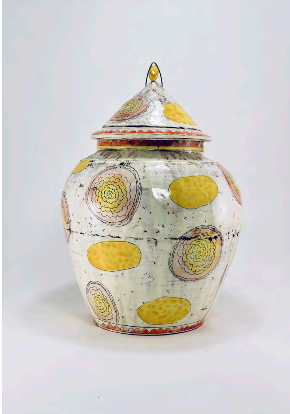
Kari Radasch Cookie Jar , 2019 Glaze fired earthenware 15 x 10 x 10"