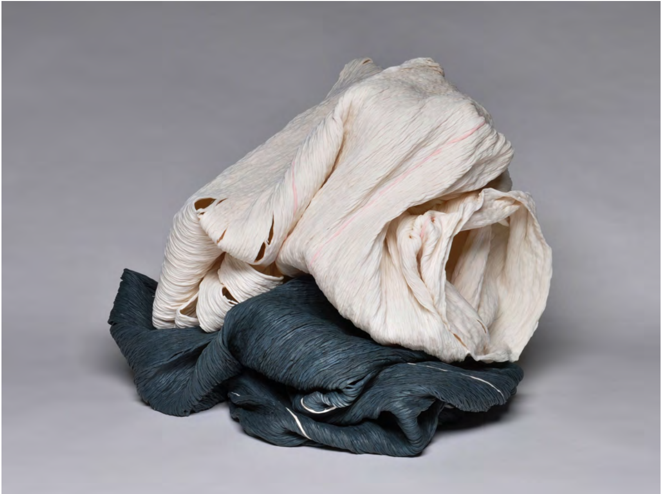
Cheryl Ann Thomas Pure , 2017 Hand-coiled porcelain ceramic 16.5 x 22 x 19"