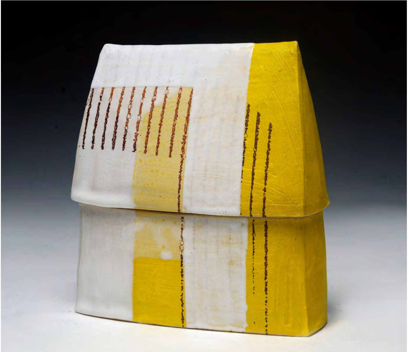
Stacy Snyder Yellow House Jar , 2019 Stoneware 10 x 8 x 3"