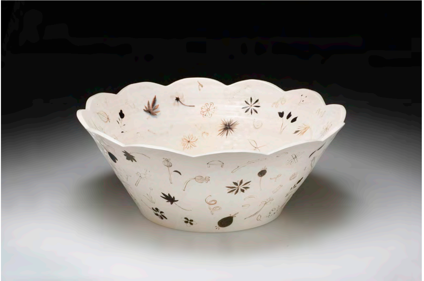
Linda Sikora Constellation Bowl , 2019 Porcelain, underglaze painting, salt fire (cone 8) 7 x 18.5 x 18.5"