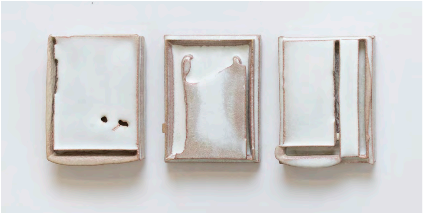
Cary Esser Disclosure (crystal series) from left: Disclosure (w1) , (w2) , (w3) , 2019 Red earthenware, glaze 7.5 x 6 x 2" each