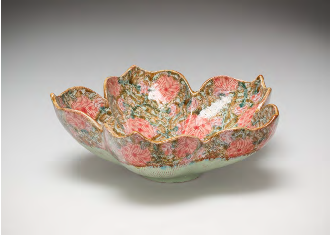
Shoko Teruyama Flower Bowl , 2019 Electric fired earthenware 5 x 11 x 11"