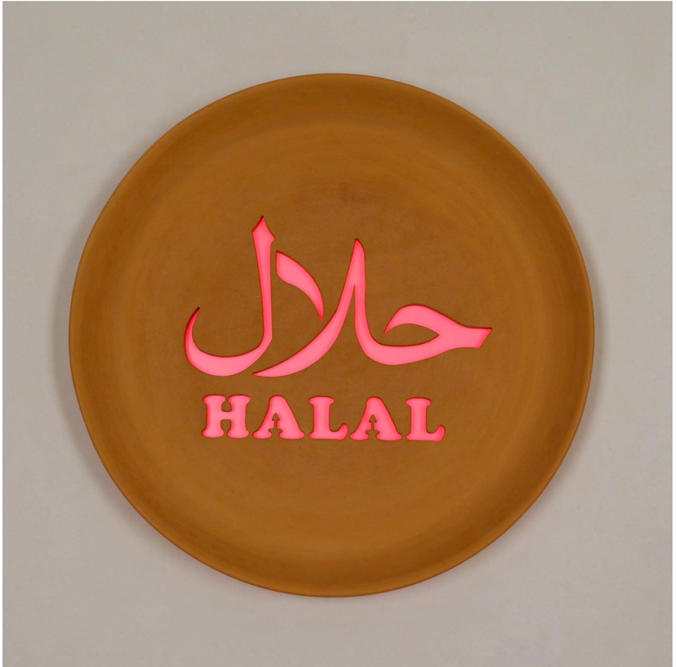
Raheleh Filsoofi Halal , 2019 Ceramics and LED light 24 x 24 x 8"