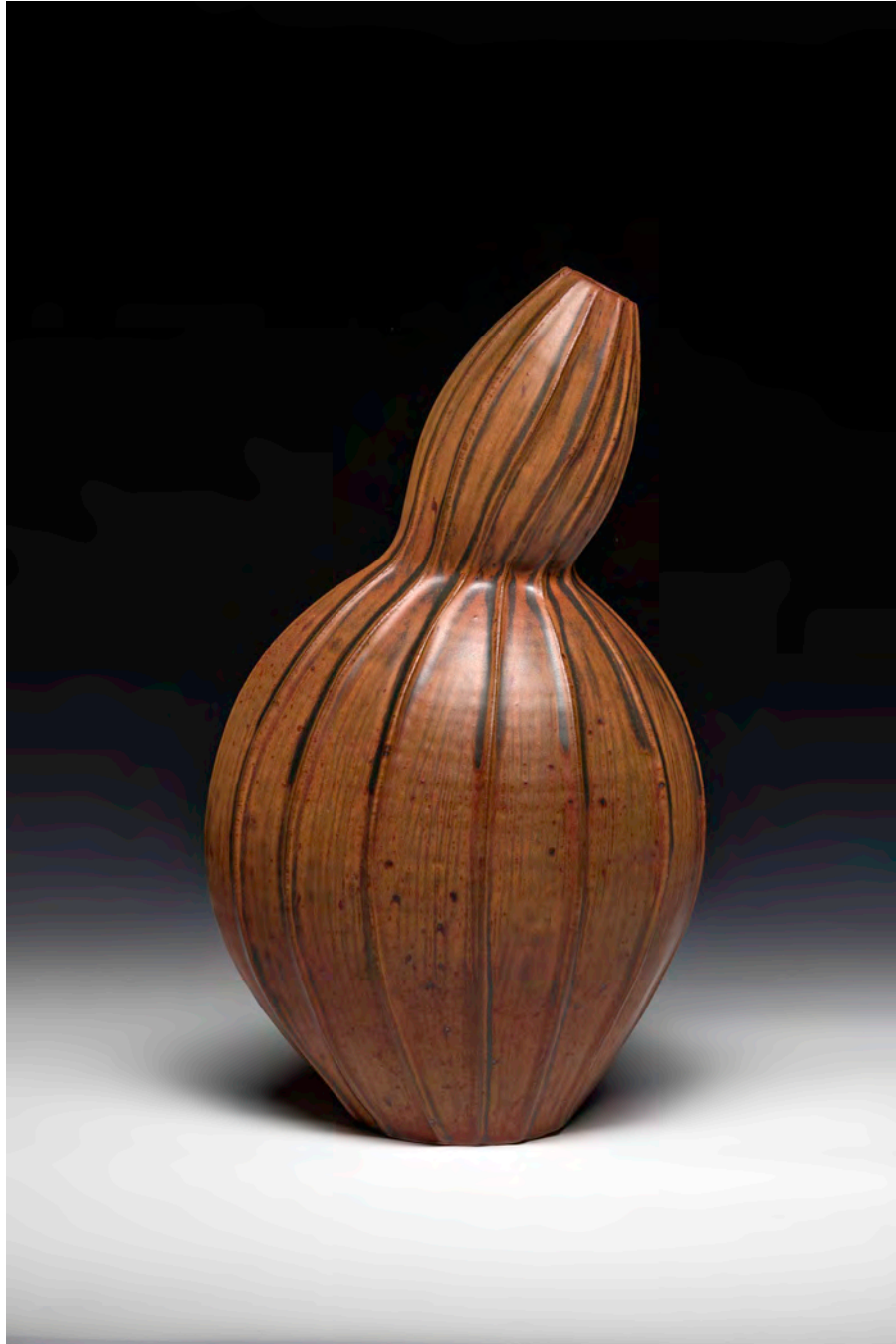
Ellen Shankin Red Gourd Form , 2017 Stoneware clay 12 x 8 x 6"