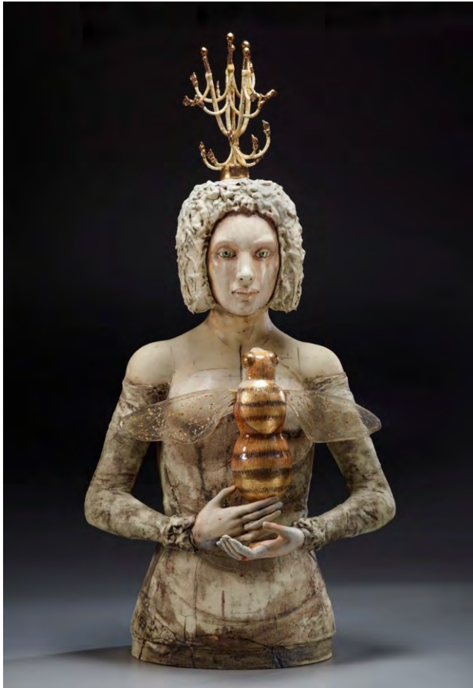
Lisa Clague Bee Queen , 2017 Clay, metal, glaze, resin, luster 49 x 26 x 20"