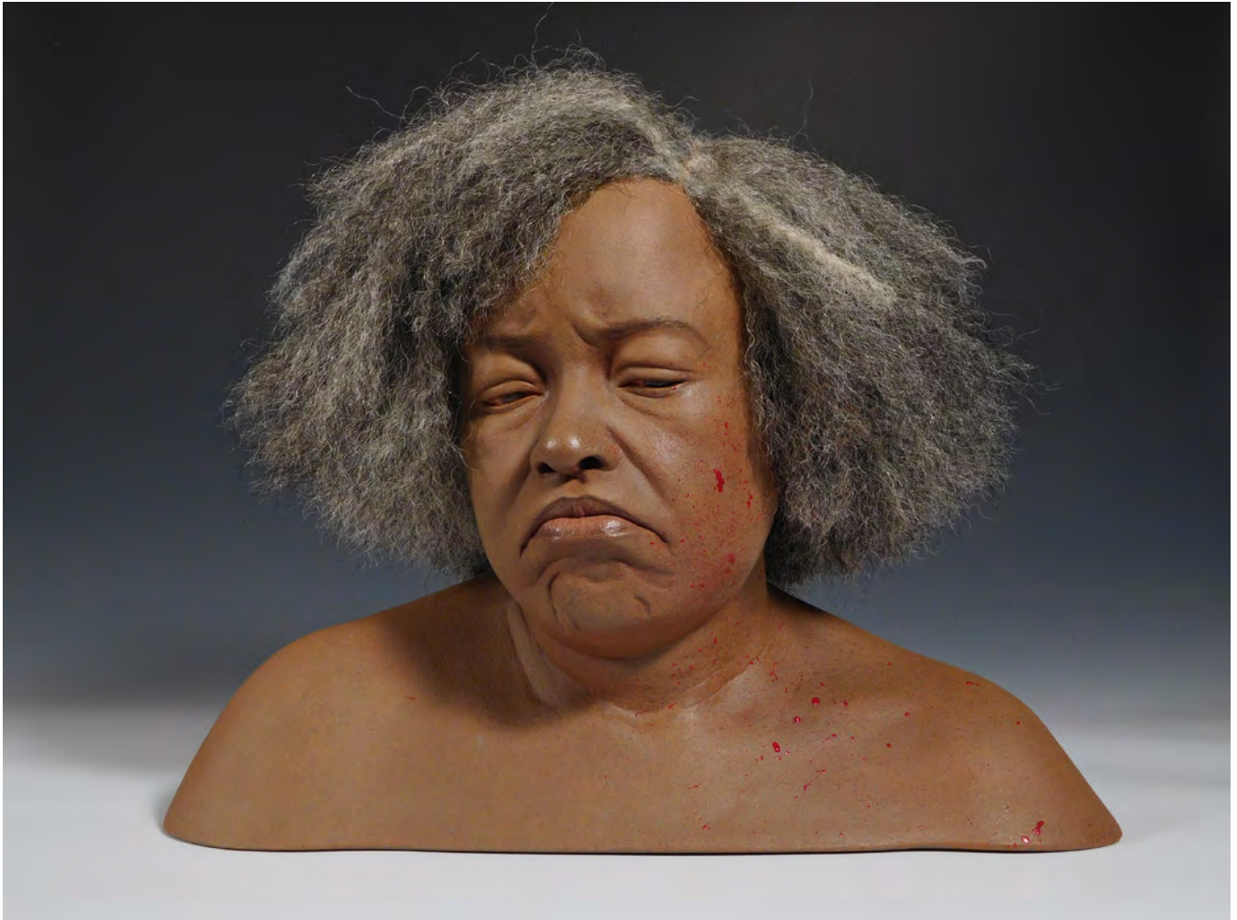
Tip Toland And Now Her Own , 2019 Stoneware clay, paint, chalk pastel, synthetic hair 13 x 17 x 9"