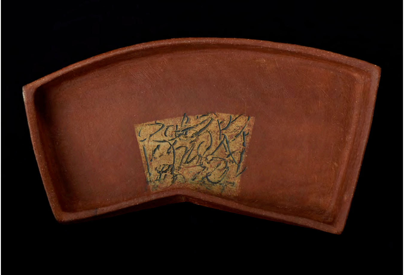
Mary Barringer Tray , 2018 Stoneware, hand built, with multiple slips and glaze 14.5 x 8 x 2"