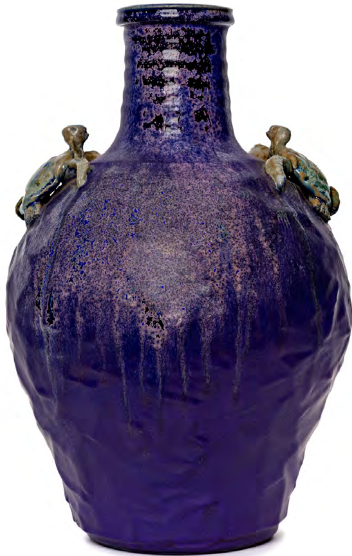
Cynthia Bringle Turtles on the Move , 2018 Stoneware, woodfired 19 x 13 x 13"