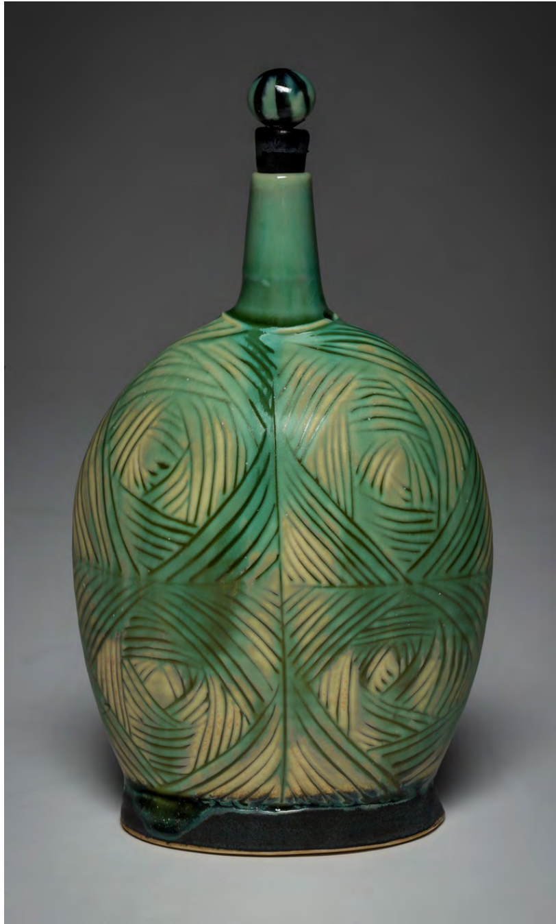
Silvie Granatelli Carved Bottle , 2018 Porcelain 10.5 x 5.5 x 4"