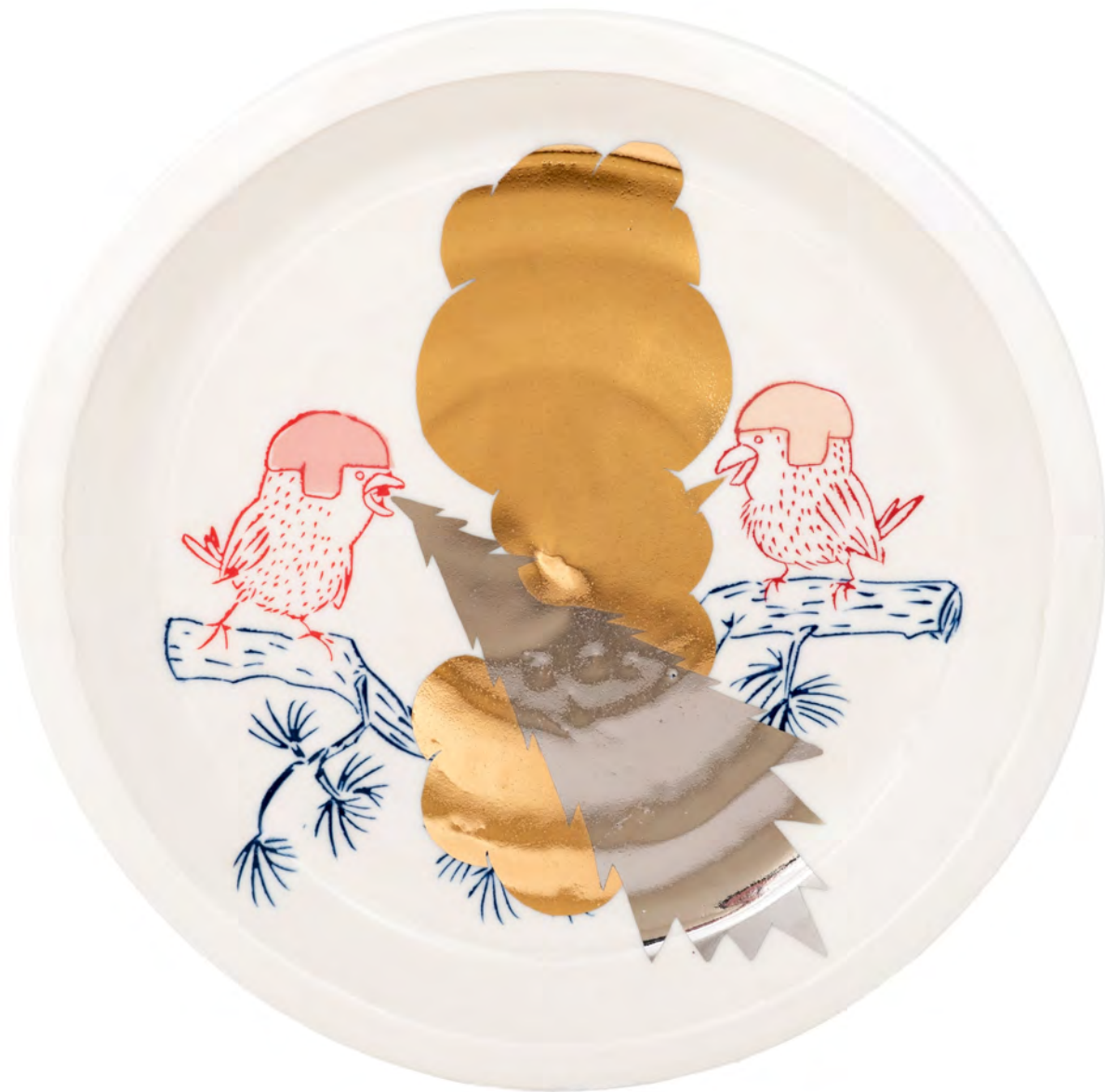
Ayumi Horie Helmeted Birds , 2019 Porcelain with luster 1.25 x 10.5 x 10.5" each