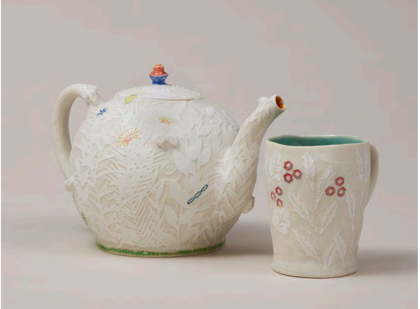
Liz Quackenbush Vermont Teapot , 2019 Hand built porcelain 9 x 5.5 x 5"