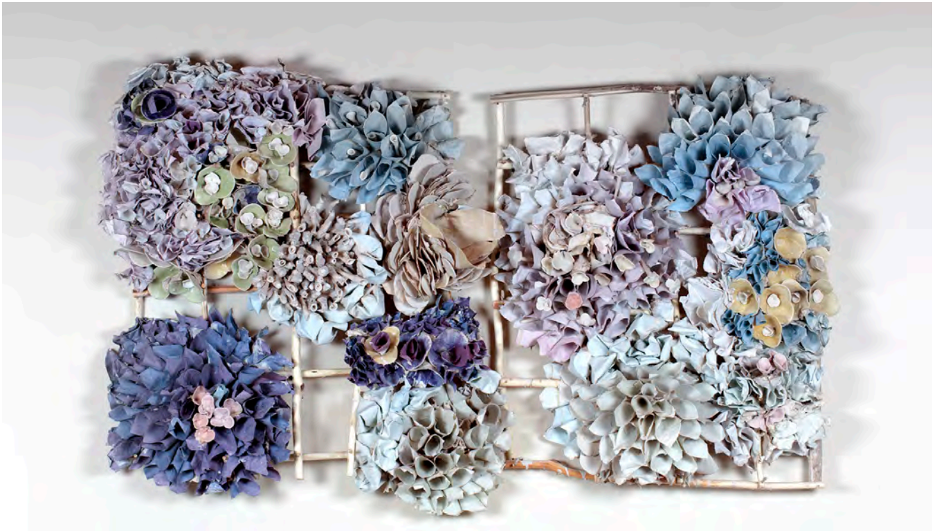
Rebecca Hutchinson Two Part Baby Blue , 2017 Fired and unfired porcelain paper clay, handmade paper, organic material 26 x 38 x 2"