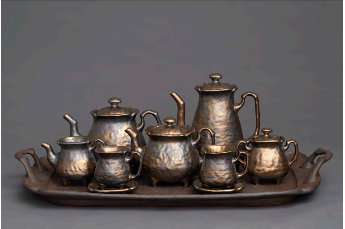
Margaret Bohls Bronze Art Nouveau Beverage Set, 2018 Stoneware 11.5 x 33.25 x 20"