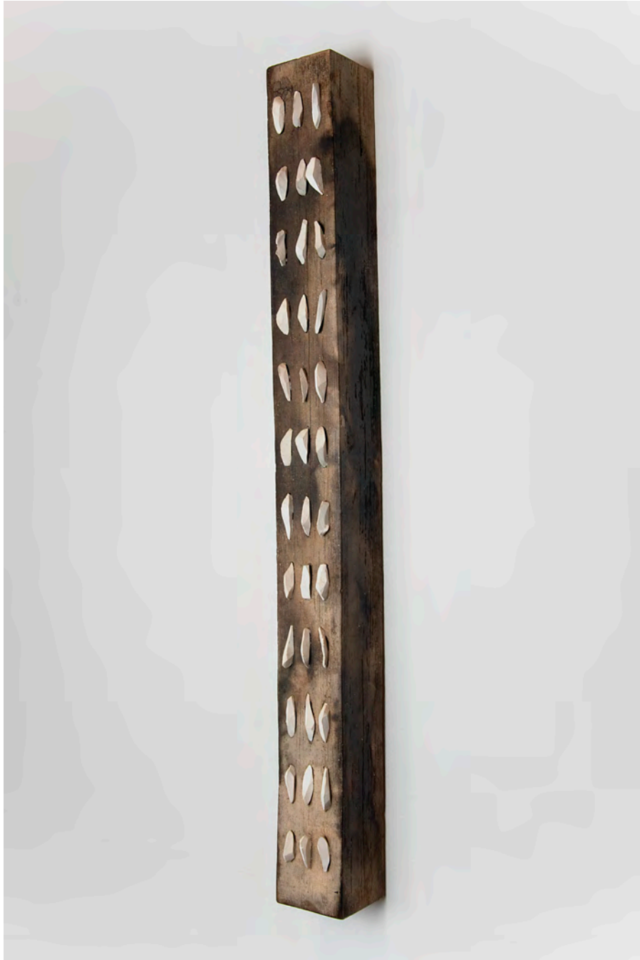
Lale Dilbaş Pain , 2006 Earthenware and porcelain 32 x 4 x 4"