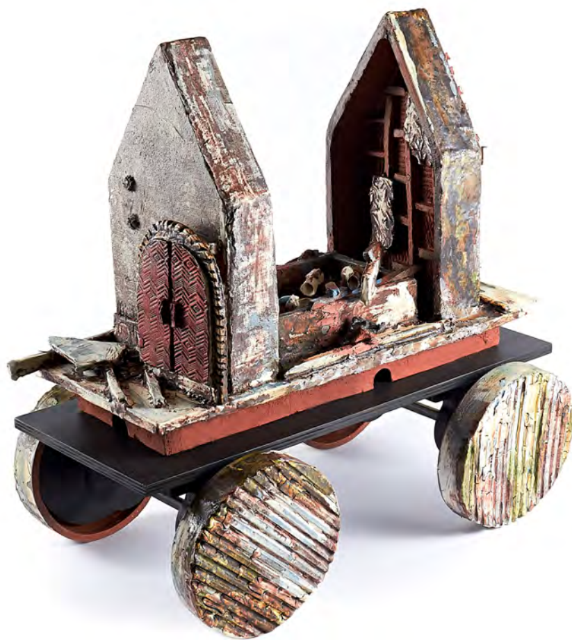
Lydia Thompson Post-Migration Omaha Series #1 , 2019 Ceramics and wood 24 x 24 x 20"