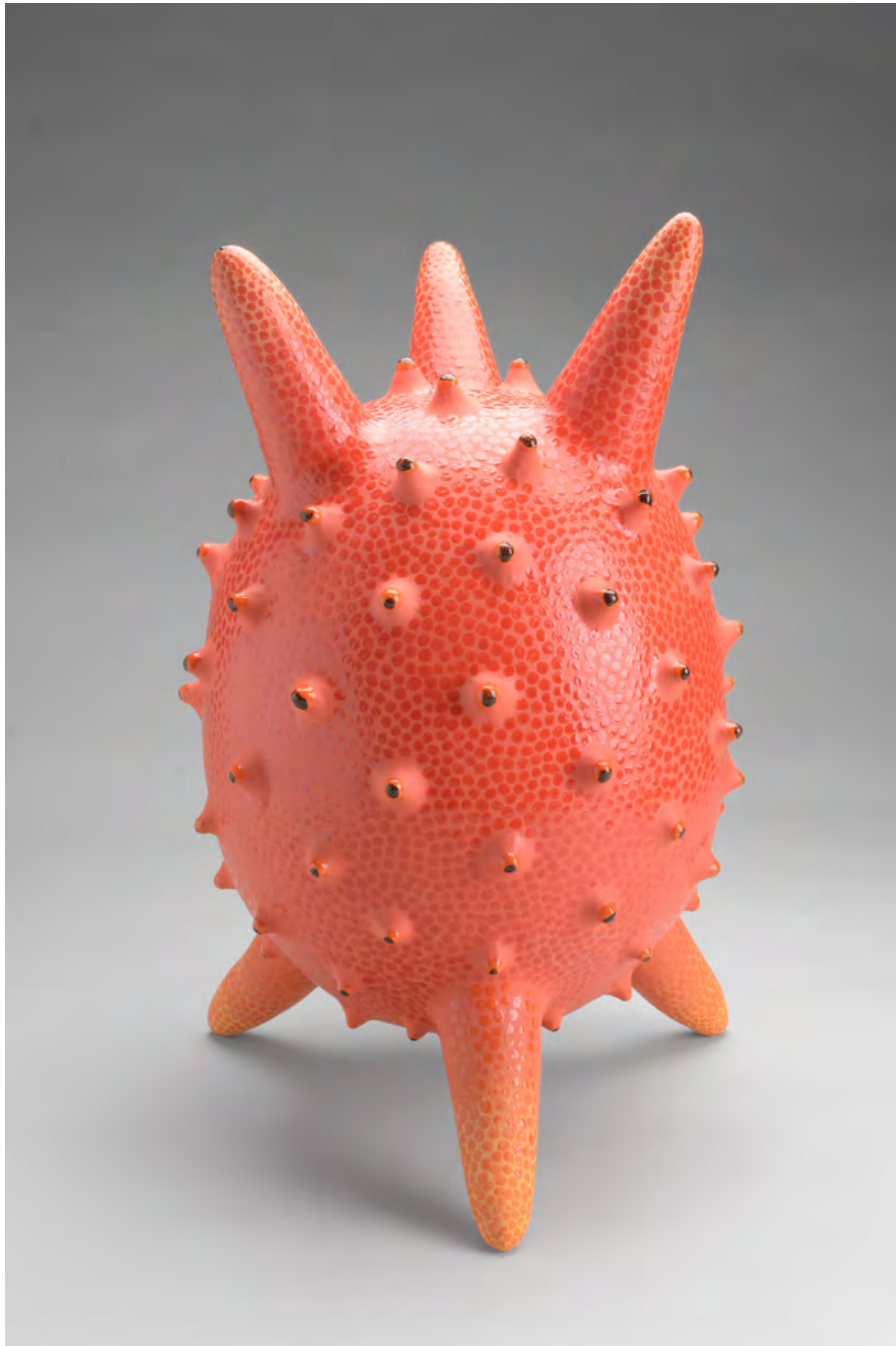
Eva Kwong Filopodia , 2019 Stoneware, wheel-thrown and assembled, painted with underglazes and glazes 17.5 x 12 x 12"