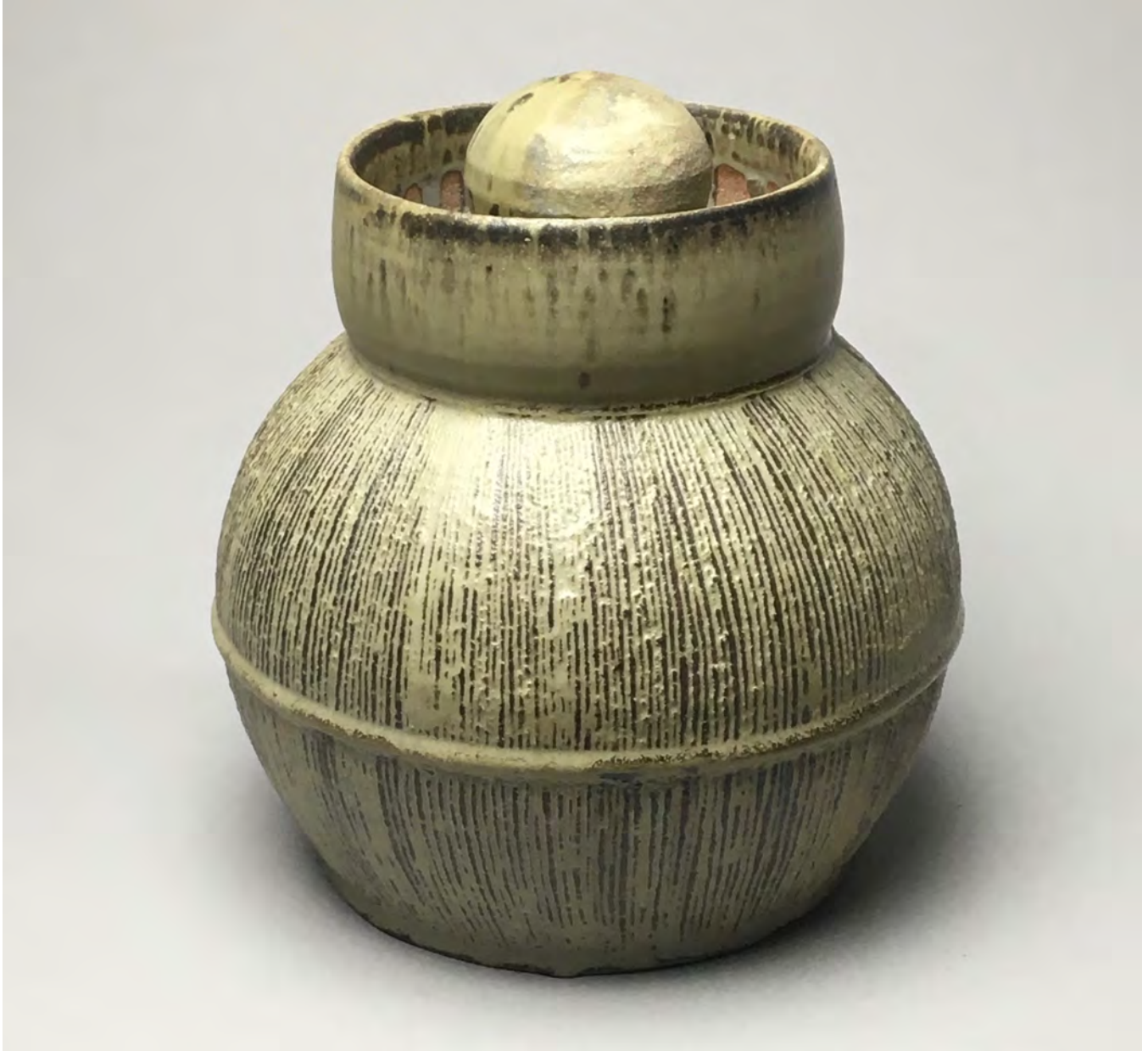
Liz Lurie Jar , 2019 Stoneware wood-fired, thrown and carved 10 x 9 x 9"