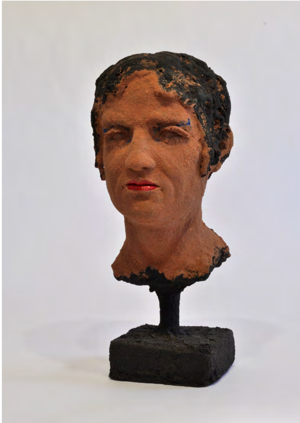
Christine Golden Red and Blue , 2018 Sand, clay, mixed media 19 x 8 x 9"