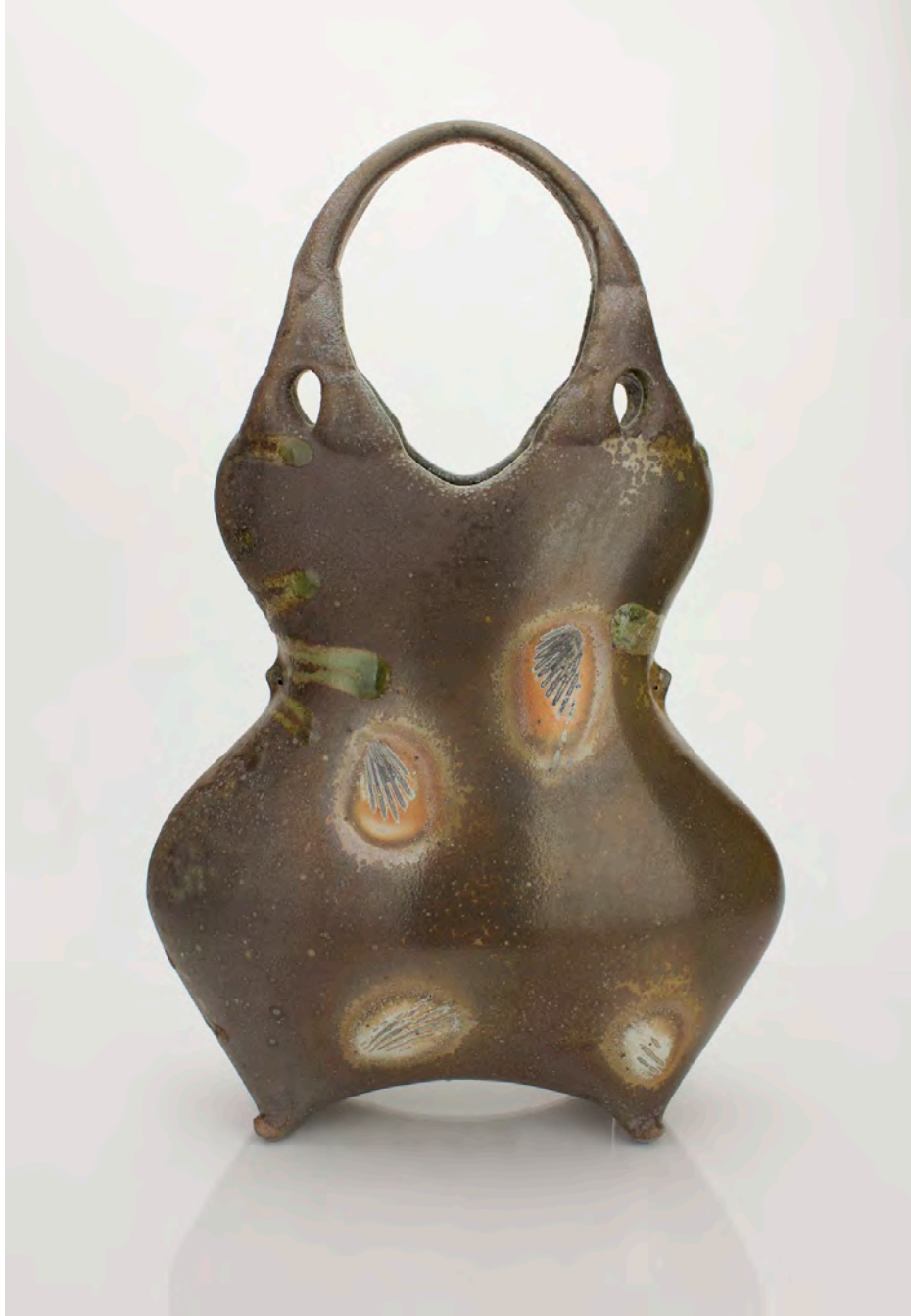
Tara Wilson Basket , 2019 Wood-fired stoneware 12 x 7.5 x 4"