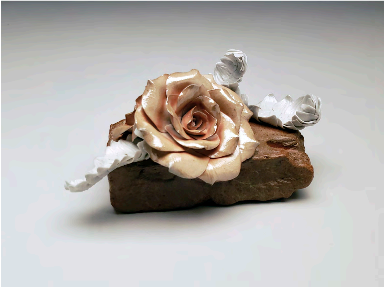
Amythest Warrington Rose Brick , 2019 Porcelain, stoneware and raku clay reduction fired to cone 10 in soda/salt 9 x 6.25 x 4.75"