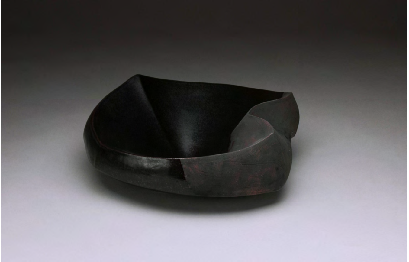
Jeri Virden Hollow Gesture (black) , 2019 Hand built earthenware 5 x 13 x 13"