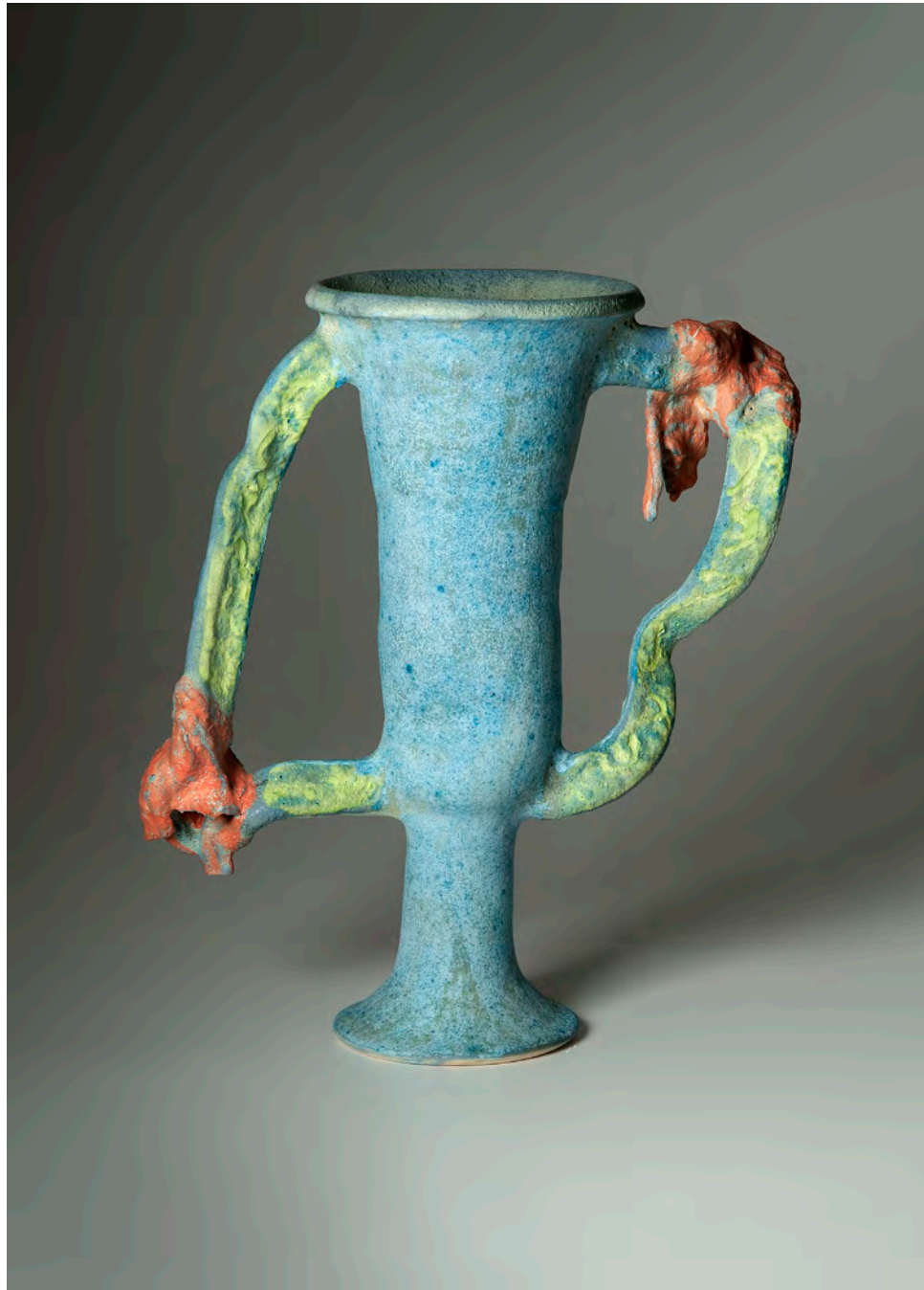
Alice Hohenberg Federico It's About "Time" (#1813), 2018 Cone 6 stoneware 14.5 x 12.5"