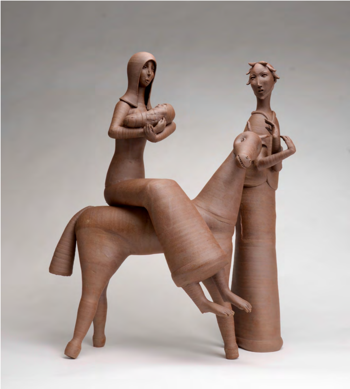
Gerit Grimm The Flight into Egypt , 2018 Stoneware 29 x 23 x 15"