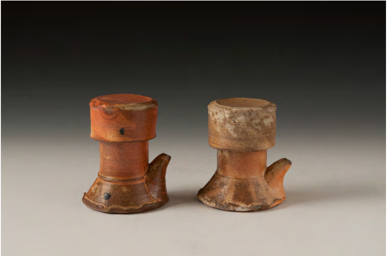
Linda Christianson 2 Ewers, 2019 Woodfired stoneware 6 x 4 x 3.5" each