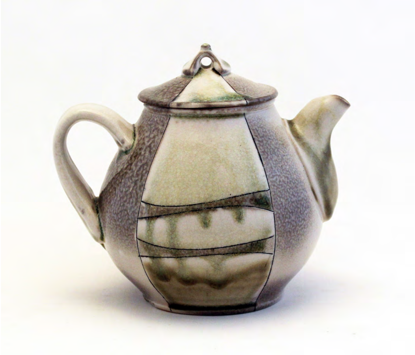
Lorna Meaden Teapot , 2019 Soda fired porcelain 6 x 4.5 x 6.5"