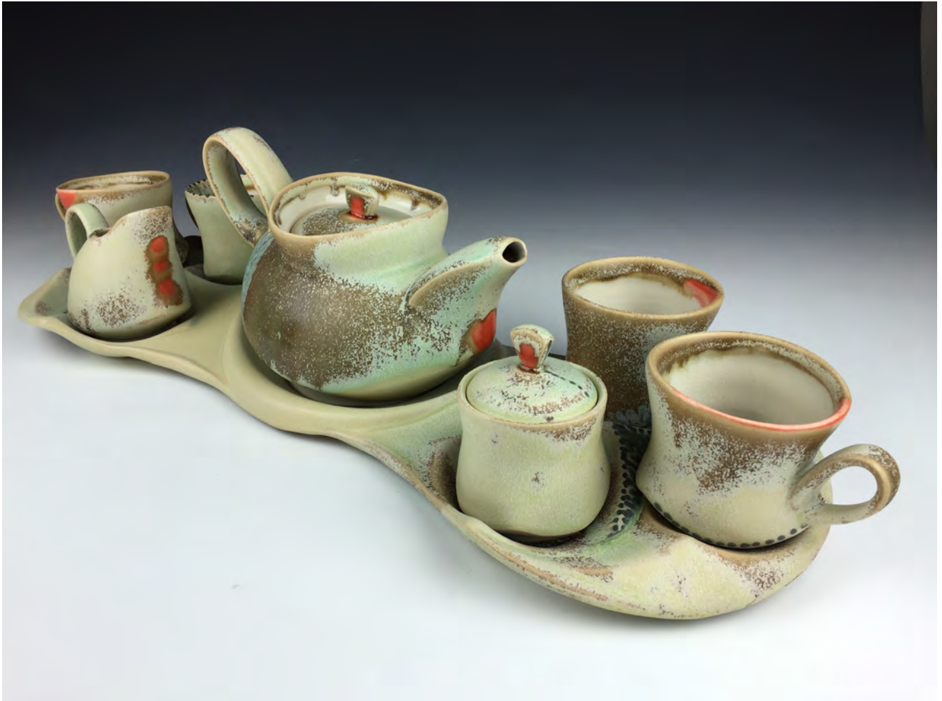
Deborah Schwartzkopf Tea Serving Set, 2019 Porcelain, wheel thrown and hand-built, cone 6 electric 5 x 19 x 9"