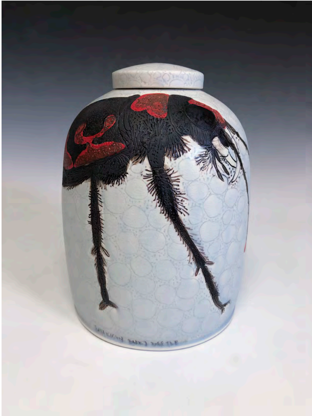
Julia Galloway American Bury Beetle Urn , 2019 Listed Critically Endangered 1989 From the Endangered Species Project Porcelain and underglazes, 7 x 6 x 8"