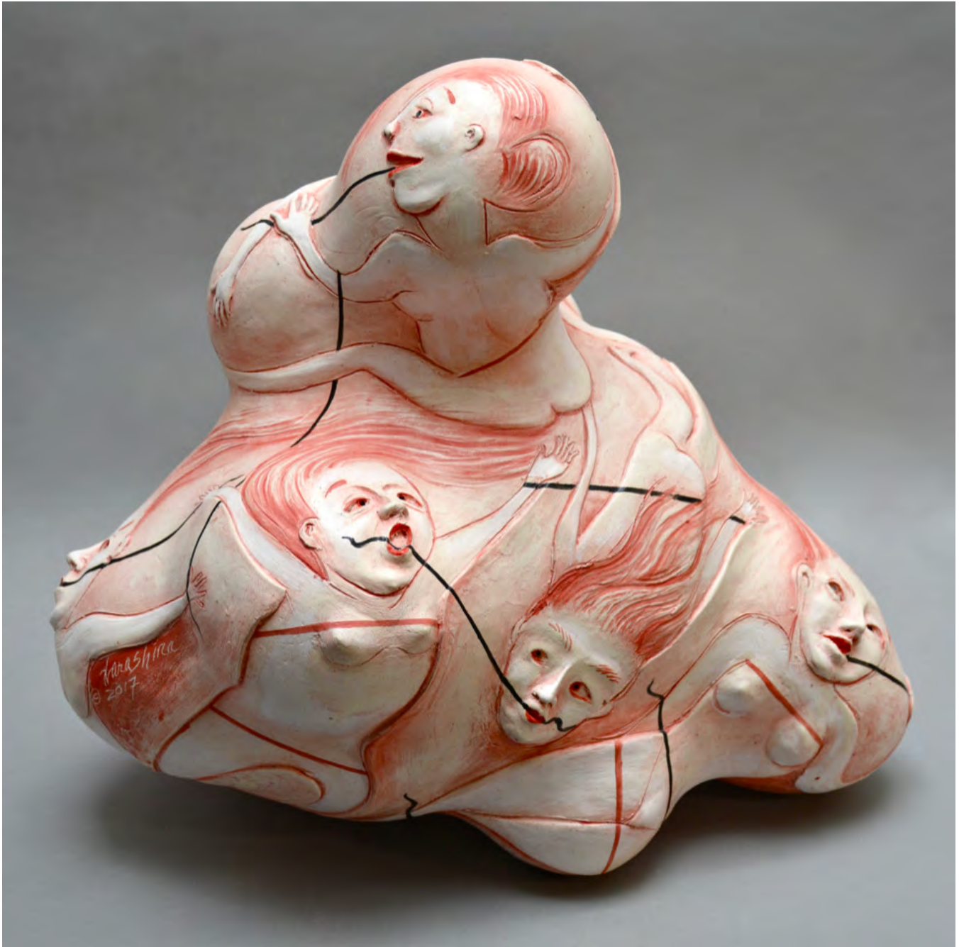
Patti Warashina Ties That Bind , 2018 Low-fire clay, underglaze, glaze 16 x 17 x 12"