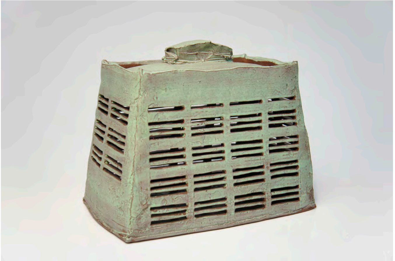
Sunshine Cobb Onion Box , 2017 Mid-range red clay, glaze 10 x 12 x 7"