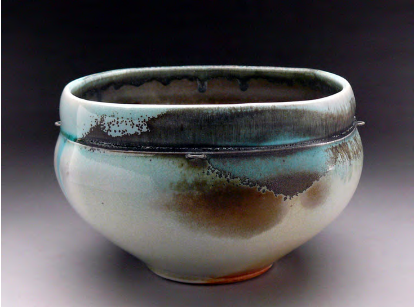
Charity Davis-Woodard Anagama Serving Bowl , 2012 Wood-fired porcelain 5.5 x 9.5 x 9.5"