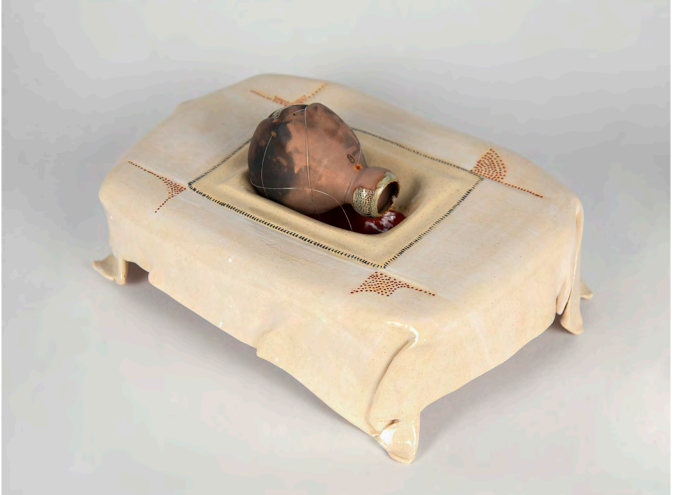
Winnie Owens-Hart Pillow Talk Series: Oppressedepressed , 2014 Porcelain and nylon filament 5 x 13 x 9.5"