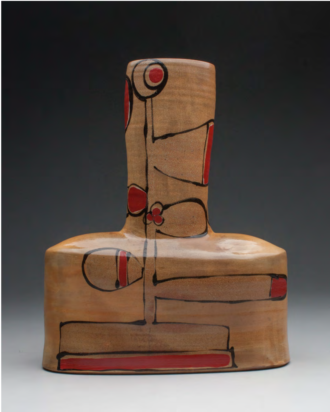
Suze Lindsay Bottle Vase , 2019 Salt-fired stoneware 18 x 15 x 5"