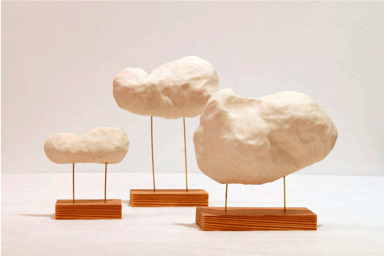
Meredith Brickell Clouds , 2019 Porcelain, brass, wood 8 x 18 x 22" (dimensions variable)