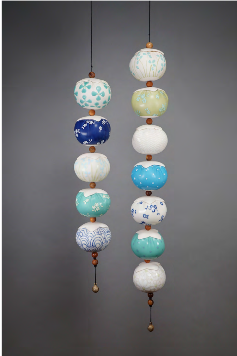
Dara Hartman Pierce , 2019 Porcelain 36 x 11 x 4"