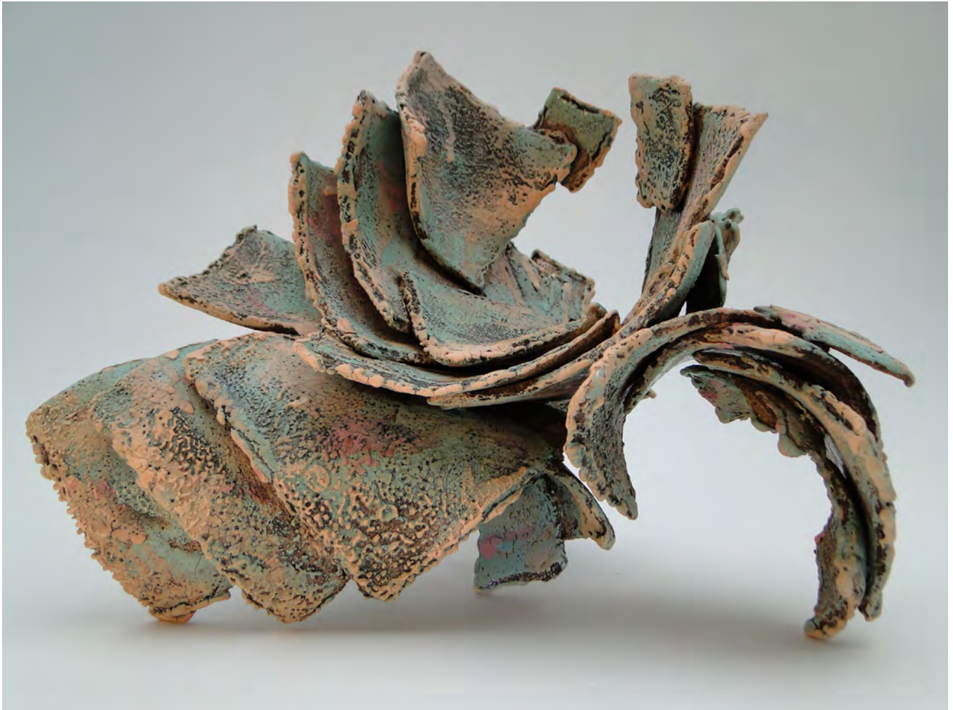
Linda Williams CRAWL , 2019 Cone 6 stoneware, oxides, slip and glaze 10 x 9 x 12"