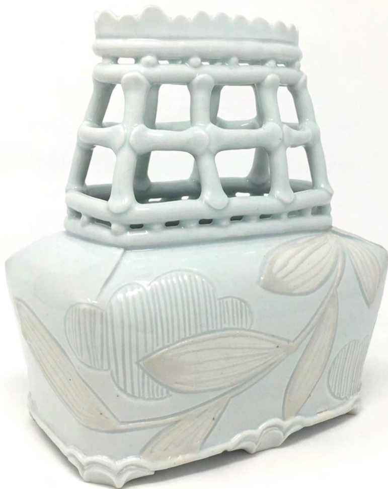
Jennifer Allen Flower Brick , 2019 Porcelain 10 x 8 x 4.5"