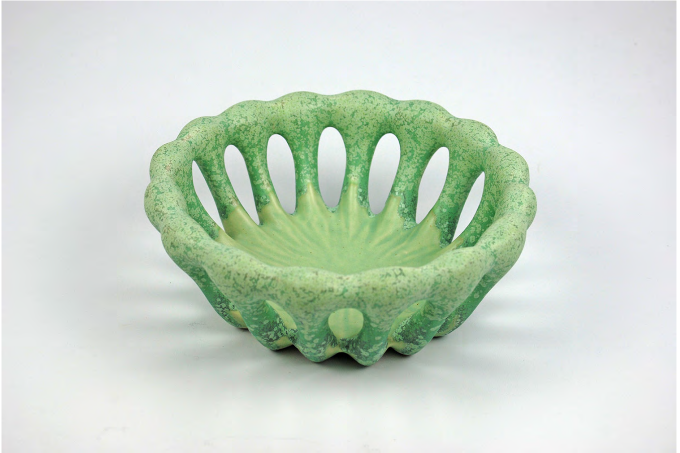
Gwendolyn Yoppolo bone bowl , 2019 Cone six matte crystalline glazed porcelain 5 x 9 x 9"