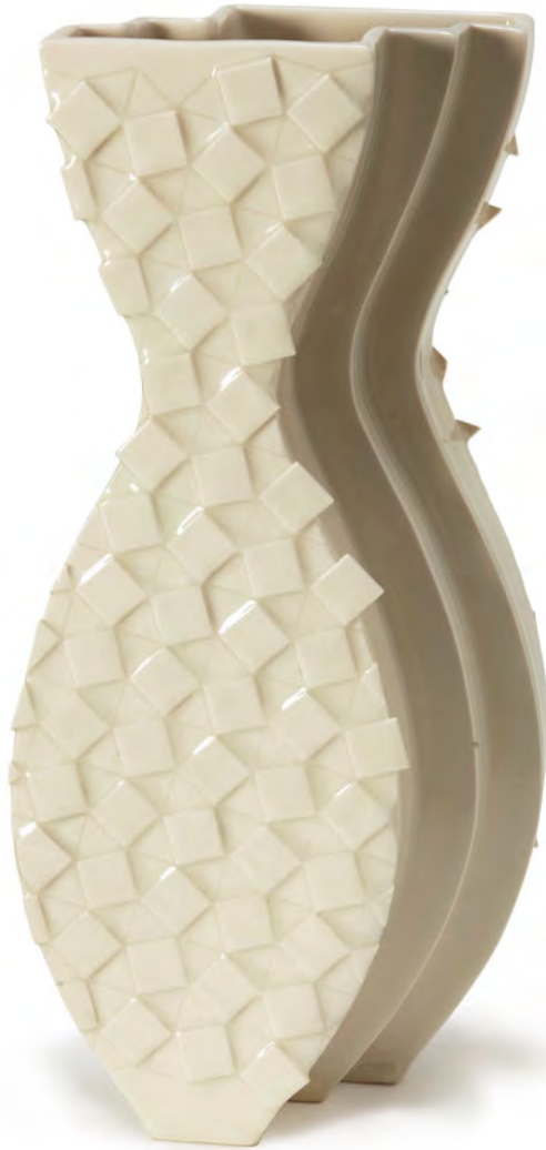
Kala Stein White Vessel , 2019 Slip cast porcelain 17.5 x 7 x 4.5"