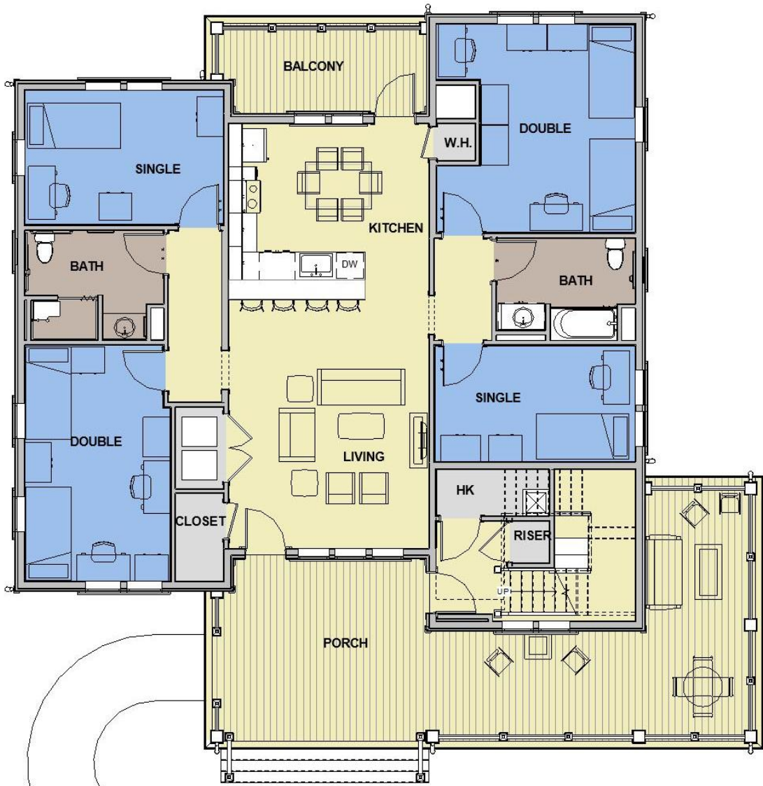
B1 ADA O.H. – First Floor