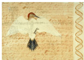
Suzanne Stryk, Genomes and Daily Observations, (Woodpecker) , acrylic and stain on paper, 2004-06