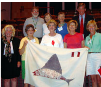
Members of the crew at Hollins in 2006