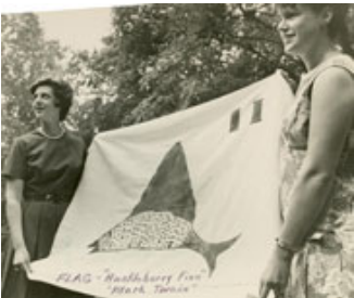
Members of the Rosebud Hobson crew hold their flag in 1966