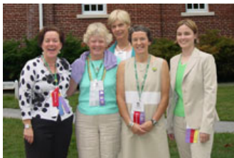
2007 Hall of Fame inductees