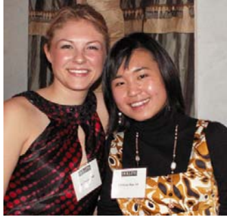
Students at the NYC J-Term event in 2007