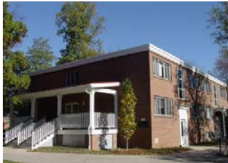
New façade on Turner Hall