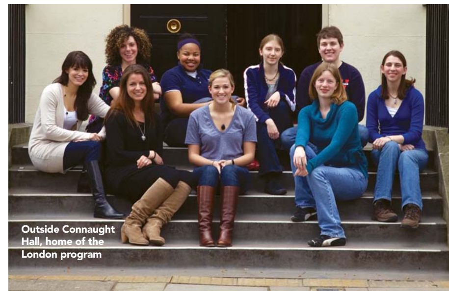
Outside Connaught Hall, home of the London program

Photos by Sarah Hazlegrove '90, May 2009